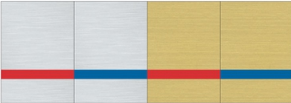
MP9X2-316 Brushed Stainless Steel/ Red MP9X2-315 Brushed Stainless Steel/ Blue MP9X2-766 Brushed Antique Gold/ Red MP9X2-765 Brushed Antique Gold/ Blue