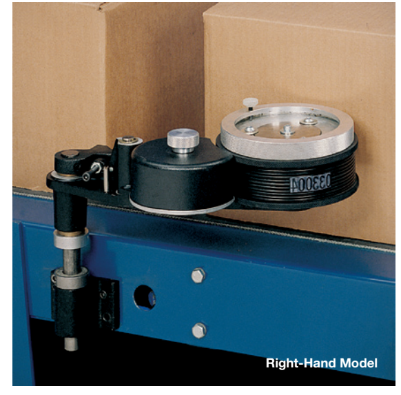
*The SL/C Coder Kits include DiLok type rings, friction bearers and XLM \operatorname{Cartridge}